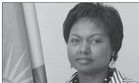
Her Excellency Mathilde Mukantabana Scheduled to speak 5/5/20